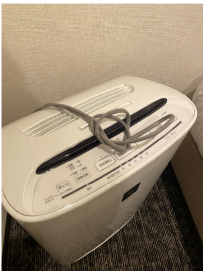
Air humidifier and purifier