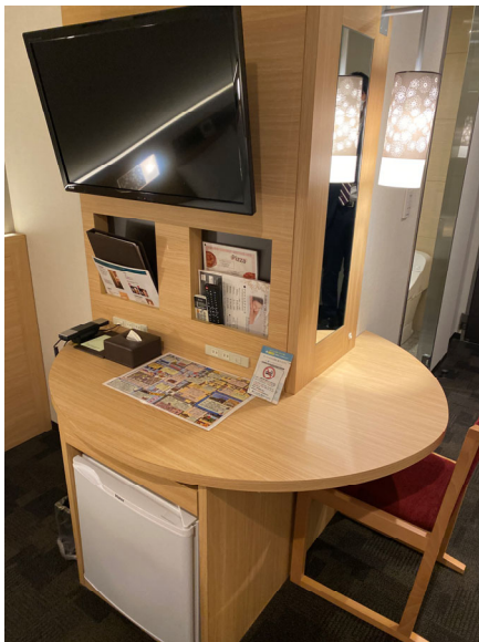
Desk, chair, TV, and refrigerator